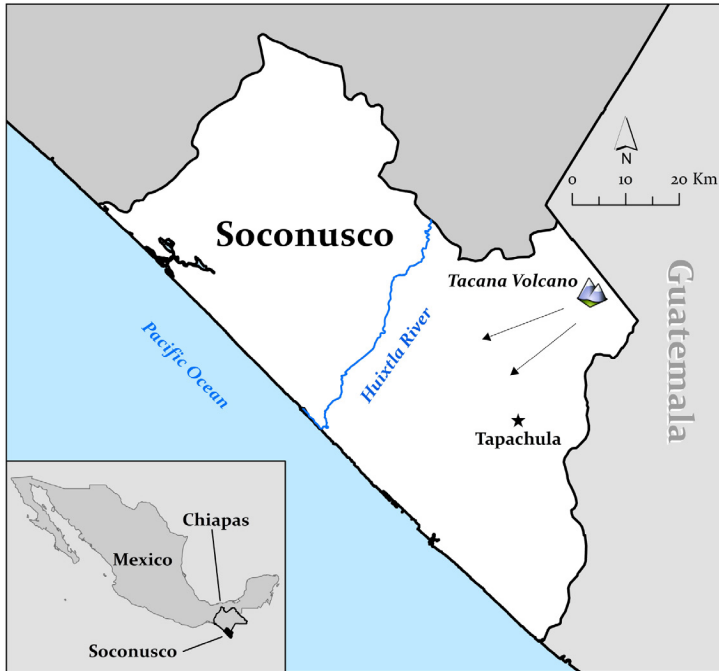
Figure 1 Expansion of Coffee Plantations in Soconusco by Finqueros in the Late XIX Century

Note: Elaborated by Marian Vittek, researcher of the Applied Spatial Research division of Wageningen Environmental Research Institute.