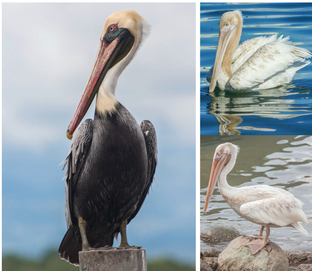
Fig. 2. Adult brown pelican (left) and leucism case in a brown pelican ( Pelecanus occidentalis) (right) in Puntarenas, Costa Rica